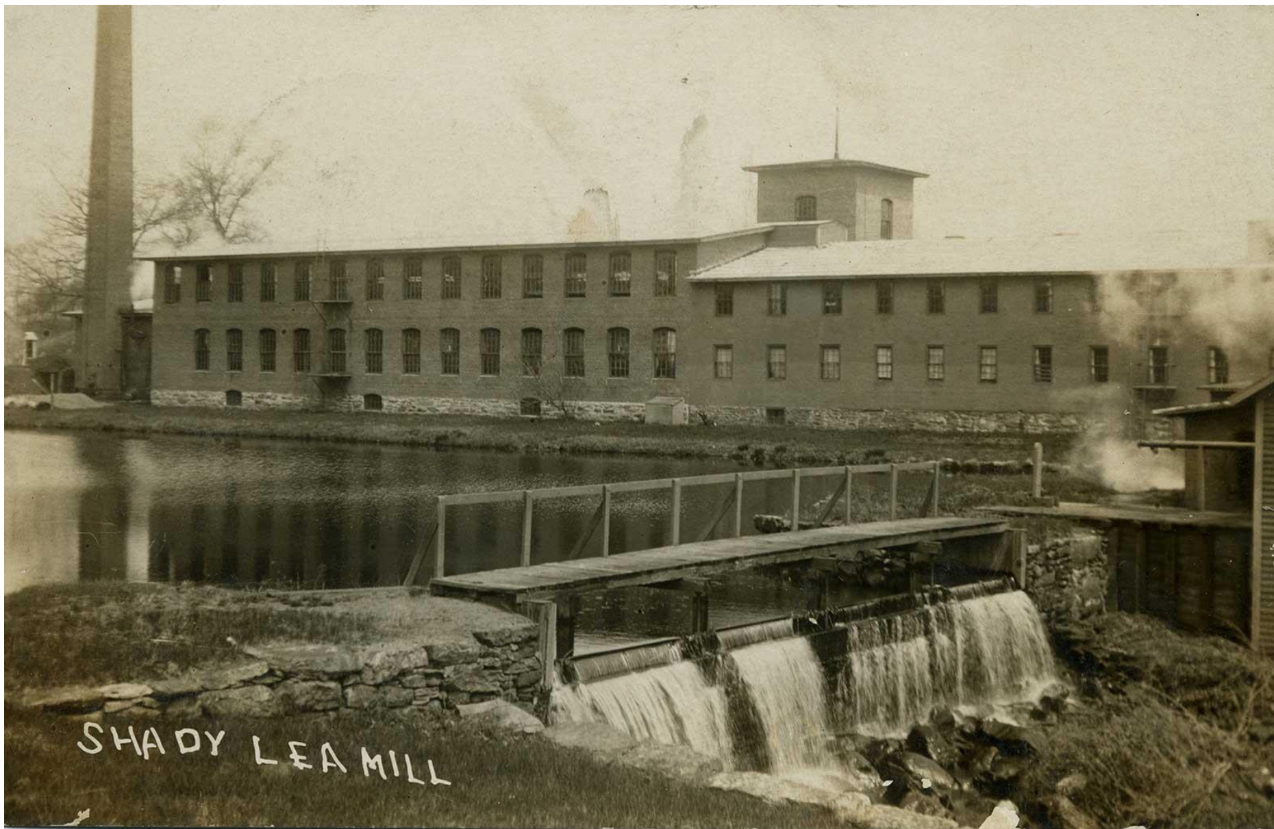
SHADY LEA MILL