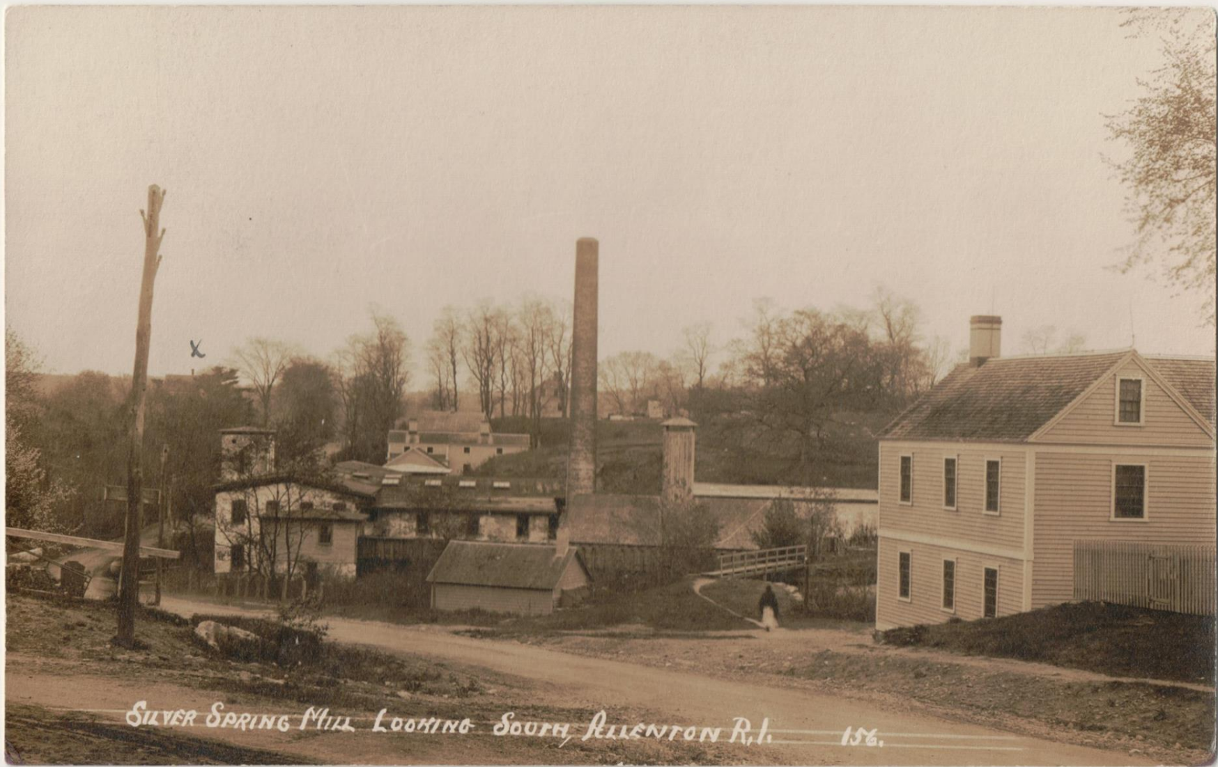
SILVER SPRING MILL. LOOKING SOUTH, SILLERTON R.I. 156.